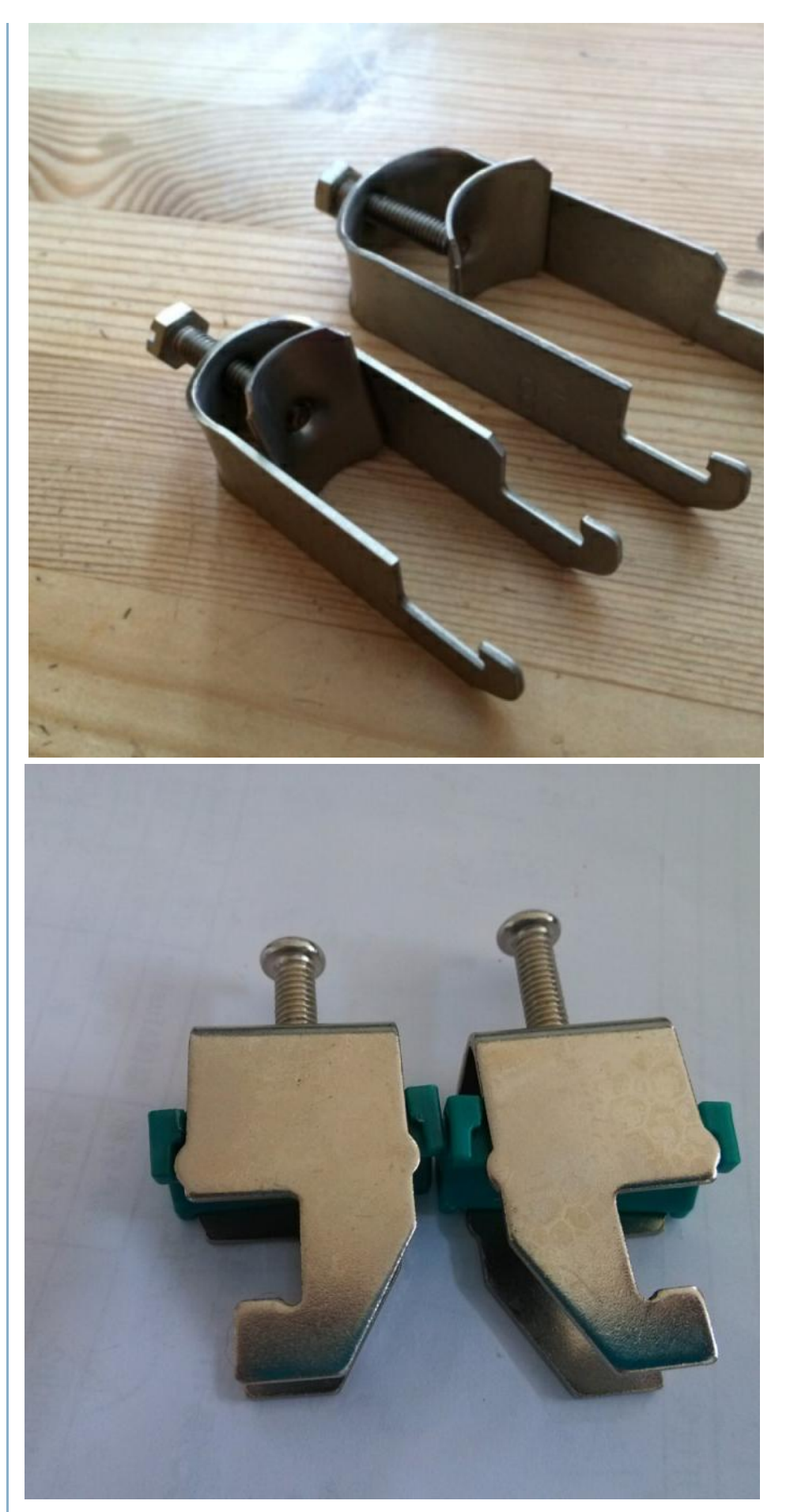
7) high quality and competative price

8) It has different bandwidths as per the different sizes.