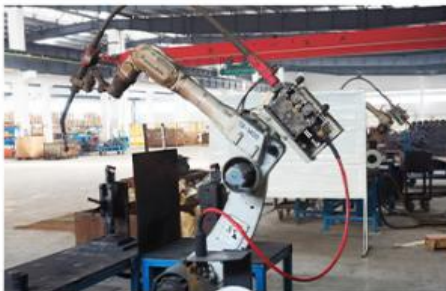
Welding Workshop ▲

HENG TONG Is located in WUXI, close to Shanghai Port. Our products are exported to Southeast Asia, South Africa, Europe, Canada, Mexico, and America. We are experienced, professional, friendly, and eager to help with any need, from simple to custom manufactured products.