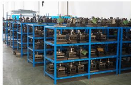
Mold Library ▲