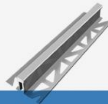
Stainless Steel Trim