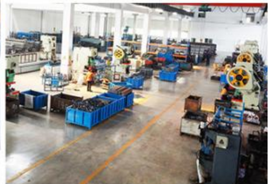
Stamping Workshop ▼