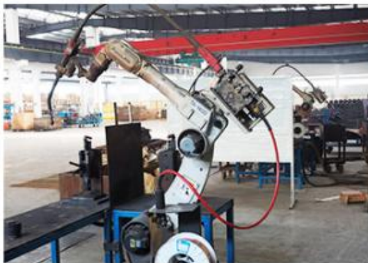
Welding Workshop ▲